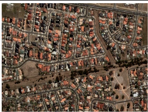
Urban growth in South Morang and Mernda including the site of the rail reservation

The City of Whittlesea, located in Melbourne's North, is home to 127,000 residents and includes the suburbs of Epping, Lalor, Mill Park, Mernda, South Morang and Thomastown as well as rural townships.