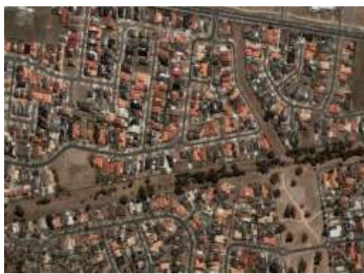
Urban growth in South Morang and Mernda including the site of the rail reservation

The City of Whittlesea, located in Melbourne's North, is home to 127,000 residents and includes the suburbs of Epping, Lalor, Mill Park, Mernda, South Morang and Thomastown as well as rural townships.