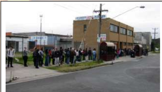
People queuing for the inadequate bus services along Wellington Road.

The Cities of Monash and Knox are home to over 300,000 residents. These municipalities contain major employment and residential areas including Monash University with over 23,000 students and a scientific precinct that includes Australia's first synchrotron.