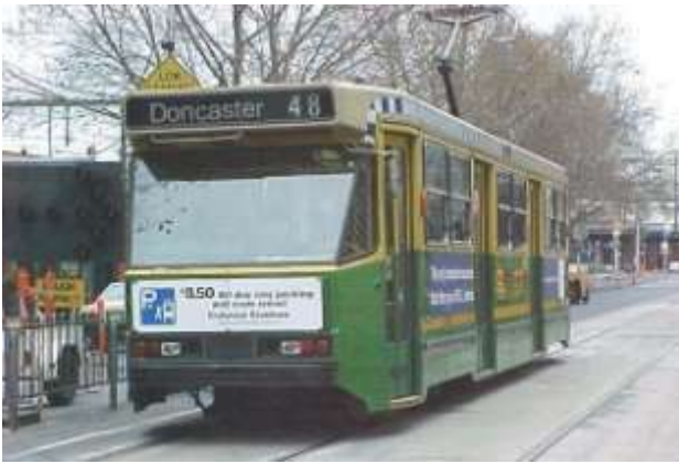
The extension of tram route 48 to Doncaster Hill (Shoppingtown) is both logical and economically feasible.

The City of Manningham is home to over 110,000 residents and is the only municipality in Melbourne that lacks any form of rail or tram access.