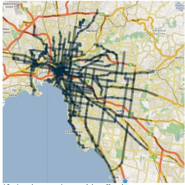
15 min or better services, weekday off-peak

During weekday off-peak hours, trams and some train lines offer frequencies high enough to travel without timetables, but vast swathes of Melbourne's suburbs have only infrequent services: