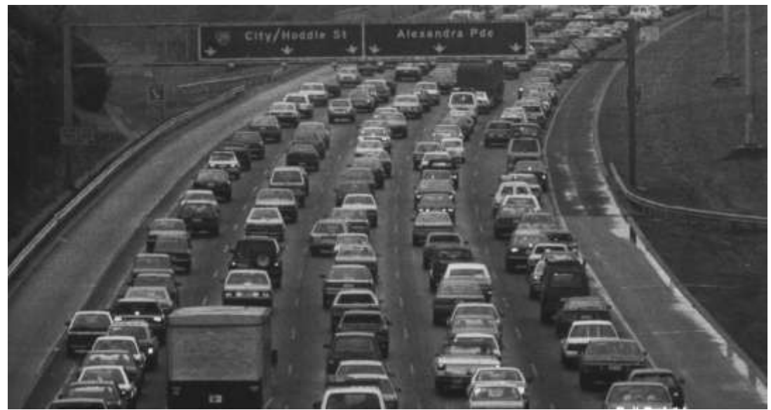
More freeways will only lengthen this traffic jam. A few modest Federally-funded public transport extensions would give people the choice to avoid it entirely.

The clearest way to demonstrate the current failings of AusLink would be to use this money to fund public transport.