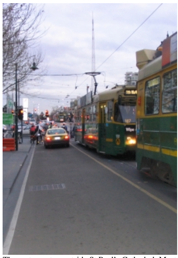
The ex-tram stop outside St Paul's Cathedral. Most trams still stop at the traffic lights – they just can't pick up passengers anymore.