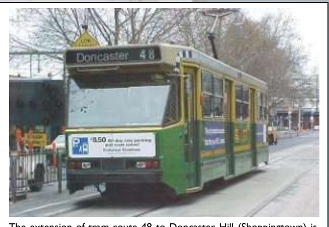
The extension of tram route 48 to Doncaster Hill (Shoppingtown) is both logical and economically feasible.

The City of Manningham is home to over 110,000 residents and is the only municipality in Melbourne that lacks any form of rail or tram access.